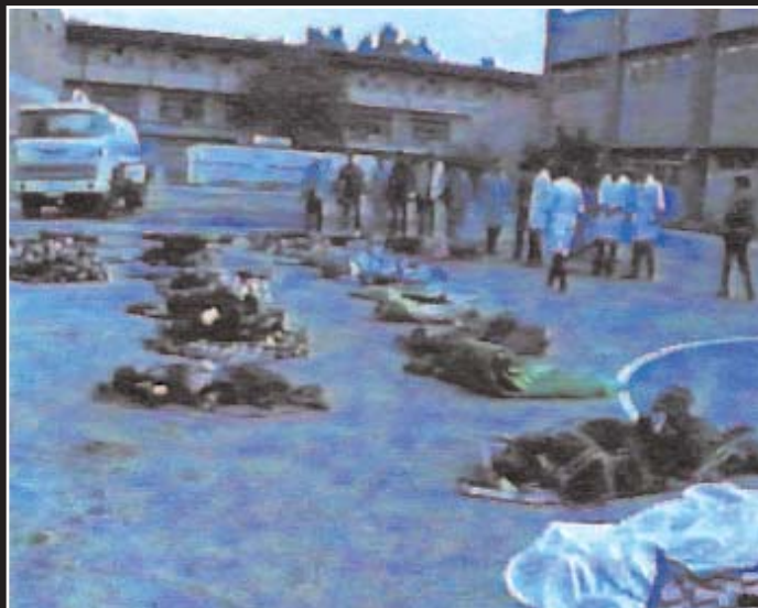
BODIES OF THE DEAD LAID OUTSIDE THE SHELTER.

IRAQIS LIVING IN THE AMERIYAH DISTRICT LATER REPORTED THAT FOR THREE DAYS PRIOR TO THE BOMBING, SURVEILLANCE AIRCRAFT REPEATEDLY FLEW OVER THE AREA. WHEN THE ATTACK CAME, A STEALTH BOMBER FIRST PIERCED THE REINFORCED ROOF WITH A GBU-27 'BUNKER BUSTING' BOMB, CREATING A HOLE 15 FEET ACROSS. FOUR MINUTES LATER A SECOND BOMBER LASER DESIGNATED ANOTHER THROUGH THIS OPENING. TEMPERATURES REACHED IN EXCESS OF 1000 DEGREES FAHRENHEIT. MANY OF THOSE ON THE TOP FLOOR SIMPLY EVAPORATED. THE LOG BOOK THAT LISTED THEIR NAMES WAS DESTROYED.