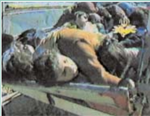
Victims of the gas attack on Halabja, March 16th 1988

In February 1988, Saddam Hussein, by then Iraq's president, formulated the notorious 'Al-Anfal' campaign, systematically destroying Kurdish settlements in the North. Iraqi forces mercilessly attacked and killed between 100,000 and 200,000 people. 4000 villages were wiped off the map. No UN Security Council resolutions were ever tabled to condemn Iraq, nor their widespread use of chemical weapons against Iran, despite the UN General Assembly's recommendation that Iraq be punished and an arms embargo introduced.