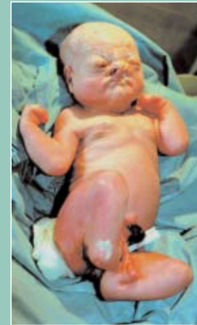
Iraqi children with extreme birth deformities, photographed in 1999

The cancer rate in Iraq has risen between two and ten fold, the deformity rate between four and six fold. The Iraqi Atomic Agency estimates that 48% of the entire population has been exposed to carcinogenic material.