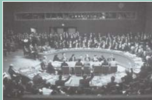
United Nations Security Council, voting on Resolution 678, 29th November 1990

- Extract from a letter to Saddam Hussein from King Hussein of Jordan, September 1990, 'Jordan and the Gulf Crisis - The Government of the Hashemite Kingdom of Jordan, Document VII'